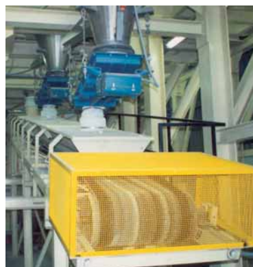
▲ Batch transportation connects the batch plant with the glass melting furnace.

The company applies the same philosophy to the in-house cullet recycling systems and recycled cullet treatment plants widely installed in the container glass industry. When it is necessary to separate ceramic particles, metals and even colours, Vidromecânica offers solutions in partnership with the most advanced machines in the world.