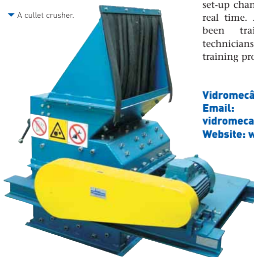
▼ A cullet crusher.

Vidromecânica provides technical assistance and information via the internet, allowing operators to make any set-up changes to the working mode in real time. All machine operators have been trained by Vidromecânica technicians on theoretical and practical training procedures. ■