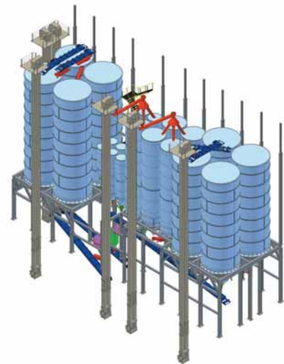
▲ An automatic serial batch plant.

The aim of Vidromecânica's engineering department during the conception phase is to minimise the number of equipments and obtain the simplest material flow. In this way, it is possible to achieve high operational reliability and low maintenance costs.