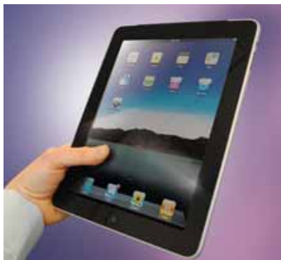
▲ Platinum group metals are used for high-quality optical and display glass used in LCD panels.

Platinum and platinum-rhodium alloys are used in the linings of vessels that contain, channel and form molten glass, as well as in self-supporting fabricated parts and in coatings on surfaces such as ceramic stirrers, bowls and orifice rings. The high melting point of PGM and their resistance to corrosion gives them unique properties of strength and durability in the highly aggressive environment of molten glass. Where platinum is alloyed with zirconia, the mechanical strength of linings and fabrications can be further enhanced. This enables the operating lifetime of equipment to be extended, can improve return on investment and lower total energy requirements. Importantly in