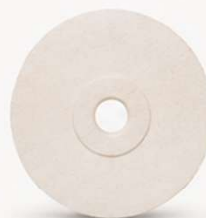
REFRACTORY ORIFICE RING