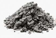
NON-CONFORMING RAW MATERIAL