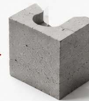
SAME QUALITY FINAL PRODUCT